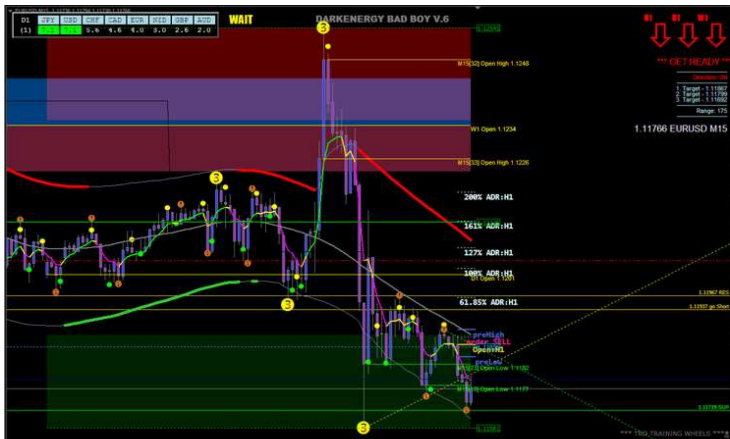
Dark Energy Bad Boy V.6