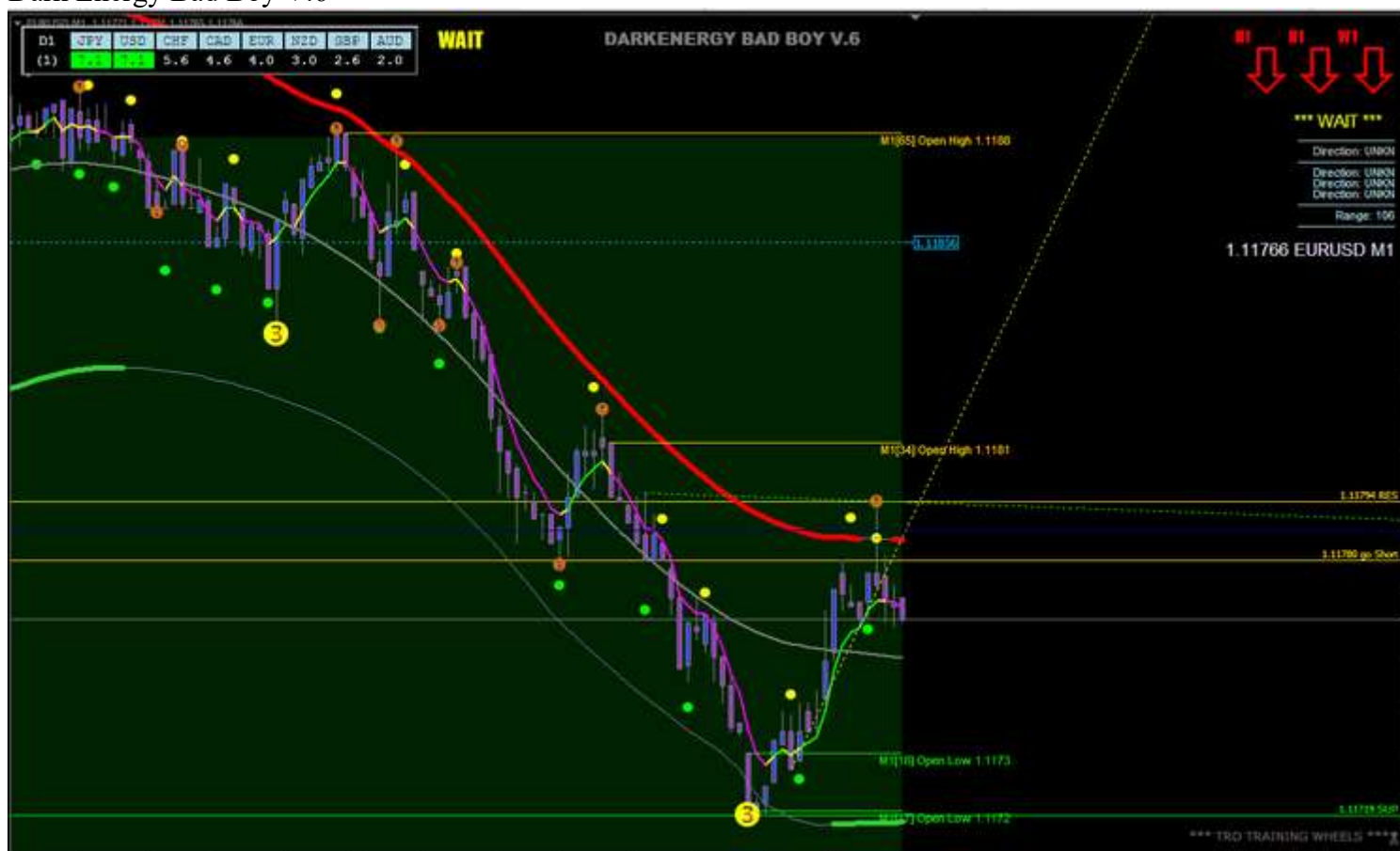
Dark Energy Bad Boy V.6