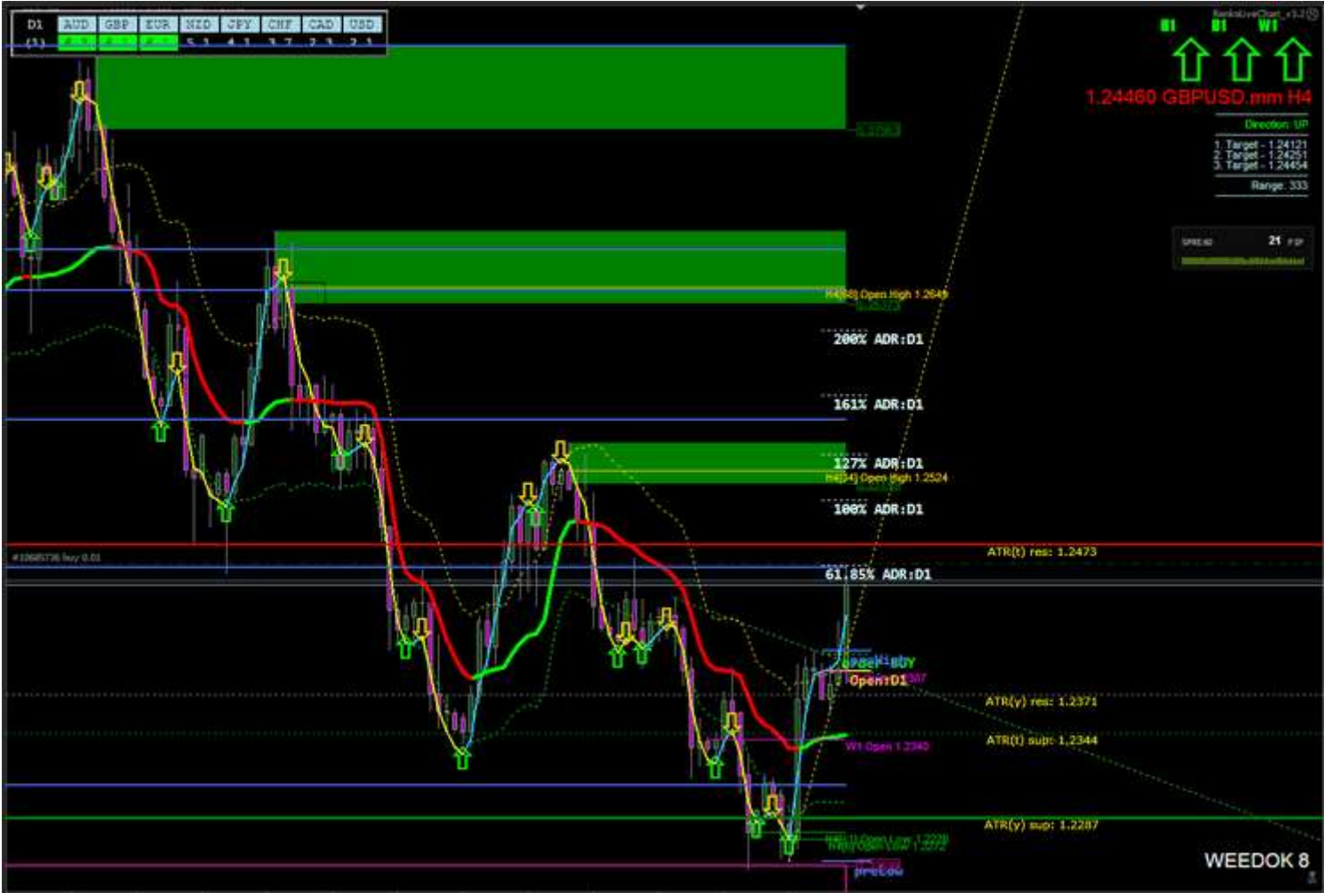
Dark Energy Weedok