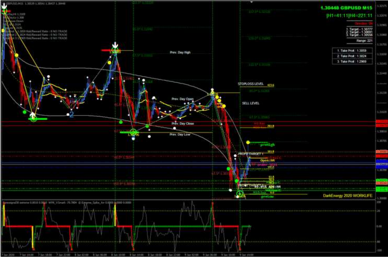
Dark Energy Work Life